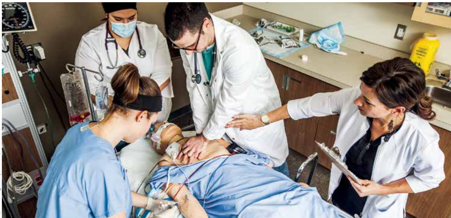
UQTR nursing lab

* Source: BDBC-OST (WoS/Thomson Reuters); special compilation (reclassement classification) UQ-DRI; octobre 2012